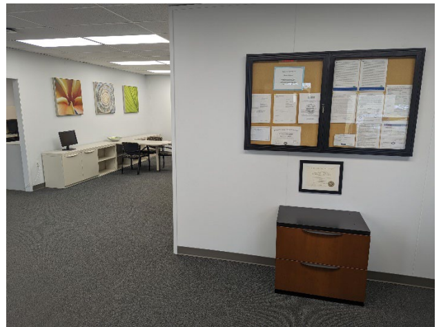
Waiting Room View 2