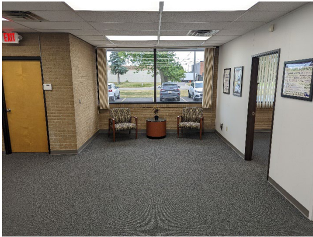
Waiting Room View 1