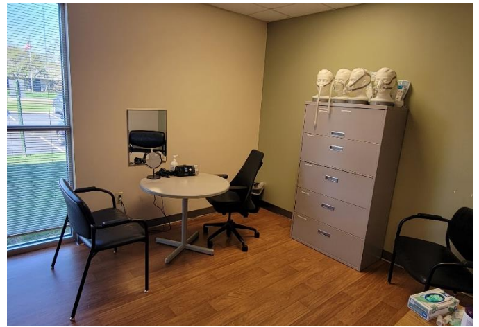
Fitting Room- Single Setup