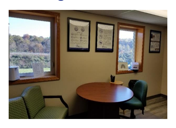
Fitting Room View 1