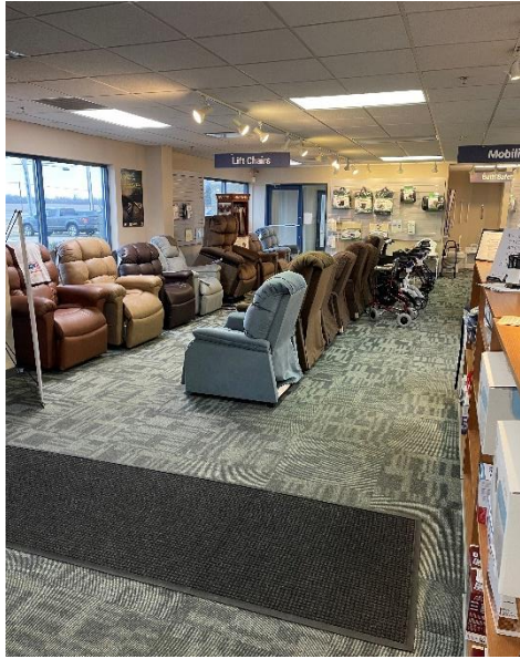
Showroom View 1